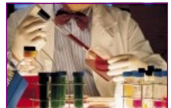
4 - Academic institutions.