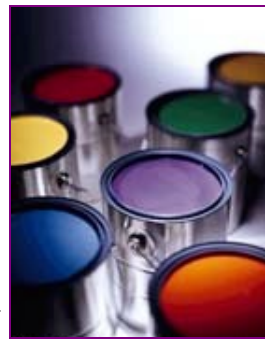
3 - Paint processing.