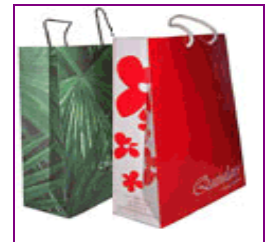
6 - Order materials on an as-needed basis.

Waste exchanges reduce disposal costs and quantities, reduce the demand for natural resources and increase the value of waste.