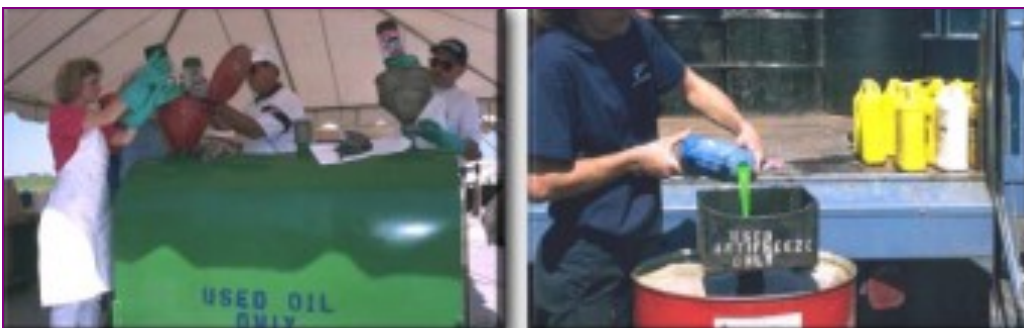
13 - Chemical waste should be disposed of according to the manufacturer's directions and State and local requirements.

A good plan should be kept where it can be easily viewed by employees near mixing and storage areas. Besides detailed instructions for staff, a spill response plan includes a diagram showing the location of all chemicals, floor drains, exits, fire extinguishers, and spill response supplies.