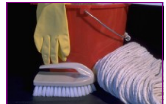
2 - Household cleaning.