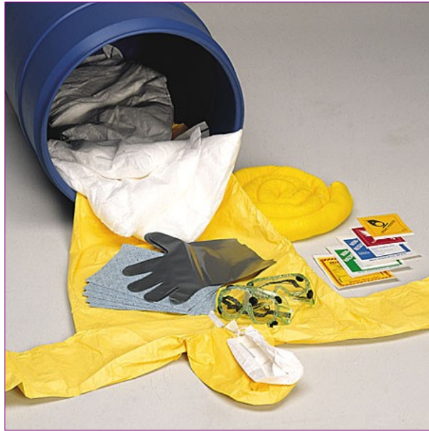
14 - Sample of spill response supplies.