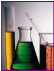
5 - Measure carefully to avoid producing large quantities of useless material.

Please keep in mind that individual prevention measures may or may not be adequate to prevent contamination of source waters. Most likely, individual measures should be combined in an overall prevention approach that considers the nature of the potential source of contamination, the purpose, cost, operational, and maintenance requirements of the measures, the vulnerability of the source waters, the public's acceptance of the measures, and the community's desired degree of risk reduction.