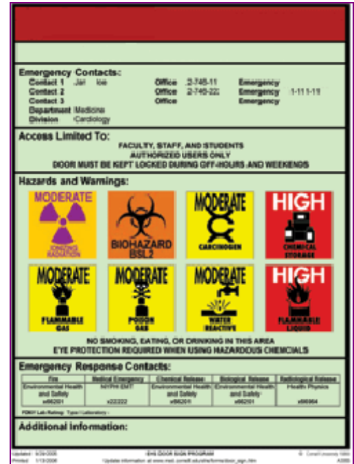
11 - Hazardous waste warnings.

Other practices to control spills include the use of funnels when transferring harmful substances and drip pans placed under spigots, valves, and pumps to catch accidental leakage. Sloped floors allow leaks to run into collection areas. Catch basins in loading dock areas, where nearly one third of all accidental spills occur, can help recapture harmful chemicals. All practices should be performed in a way that allows the reuse or recycling of the spilled substance.