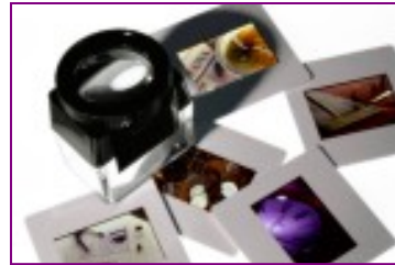
1 - Photo finishing.

Examples of places where small quantity chemical use occurs.